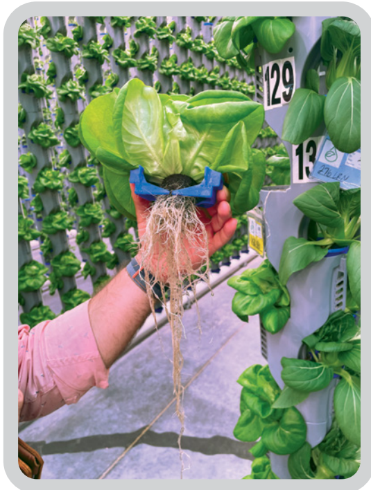
Impressive roots from a lettuce plant grown with Quick Plug.